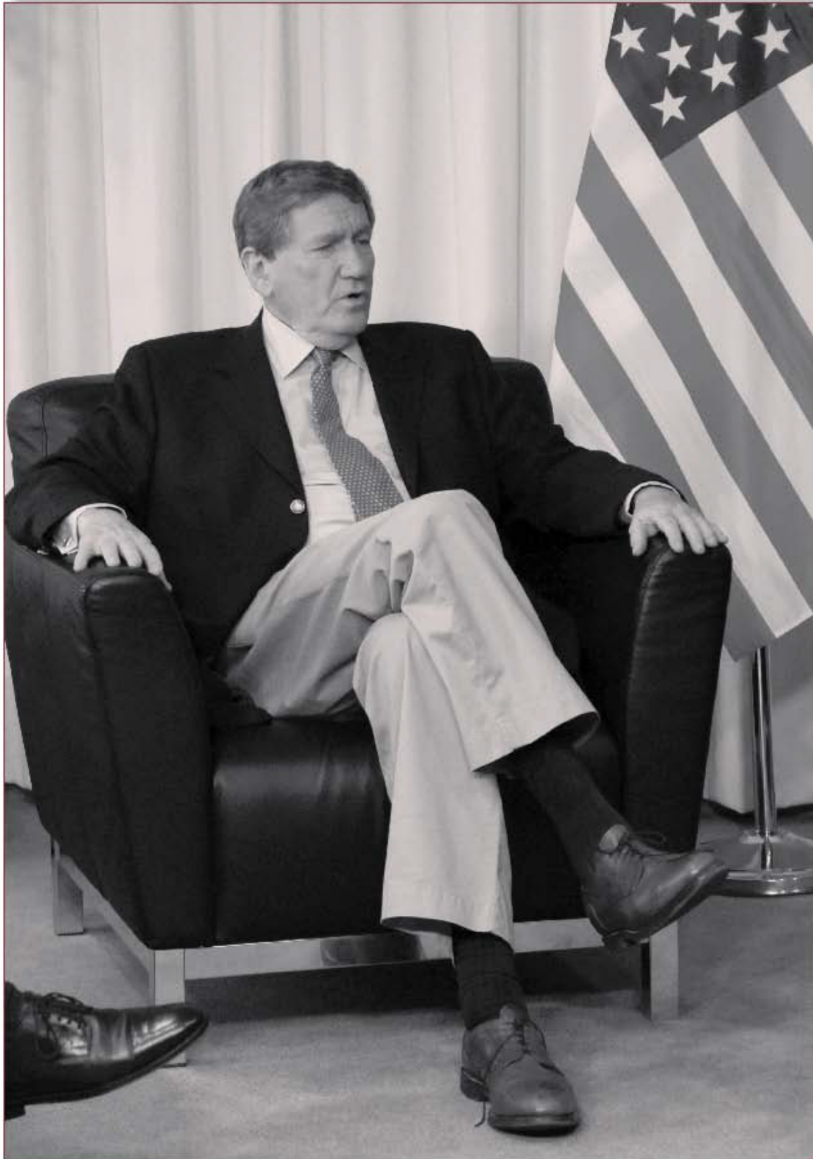
Ambassador Richard Holbrooke, U.S. Permanent Representative to the UN in 1999, sought to obtain for Israel the right of sovereign equality in the UN system, including the right to be elected to the UN Security Council.