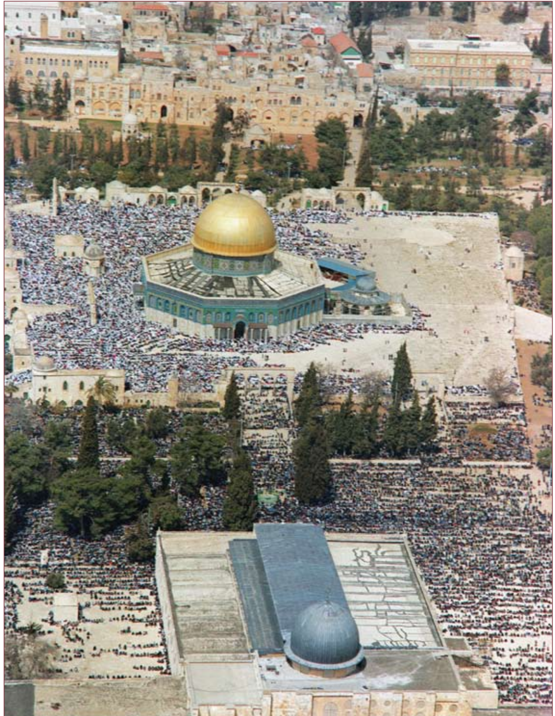
Muslims worshipping on the Temple Mount in the month of Ramadan, 1992. Under Israeli rule full religious freedom is maintained on the mount.

this new narrative is the denial of the Jewish connection to the places that are sacred to them in the Land of Israel in general and in Jerusalem and on the Temple Mount in particular. This denial is now the central theme of the discourse on Jerusalem in the contemporary Muslim world.