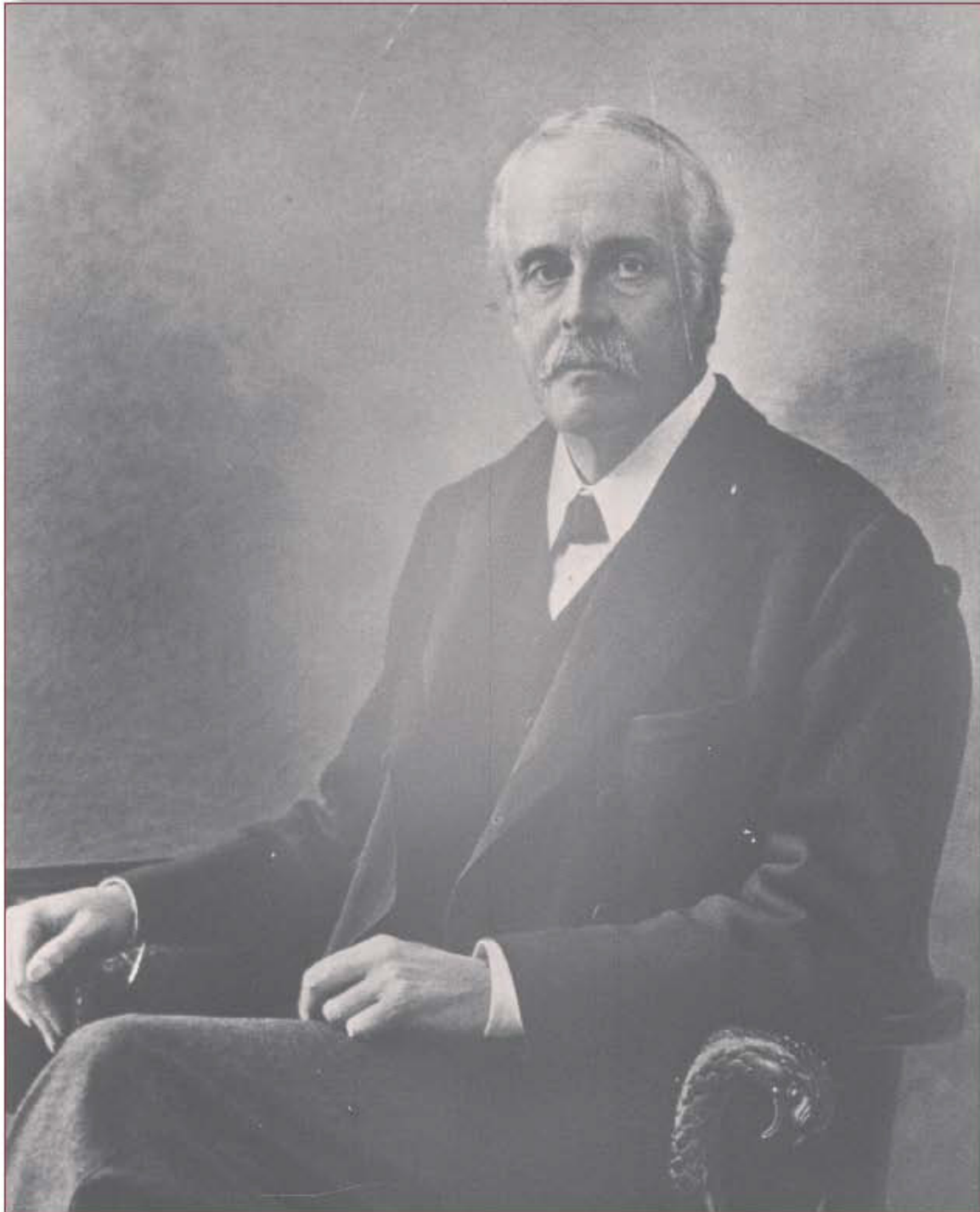
British Foreign Secretary Arthur James Balfour, 1917

The British Government supported the Weizmann-Feisal Agreement with regard to both Jewish immigration and land purchase. On June 19 the senior British military officer in Palestine, General Clayton, telegraphed to the Foreign Office for approval of a Palestine ordinance to re-open land purchase 'under official control'. Zionist interests, Clayton stated, 'will be fully safeguarded'. 7