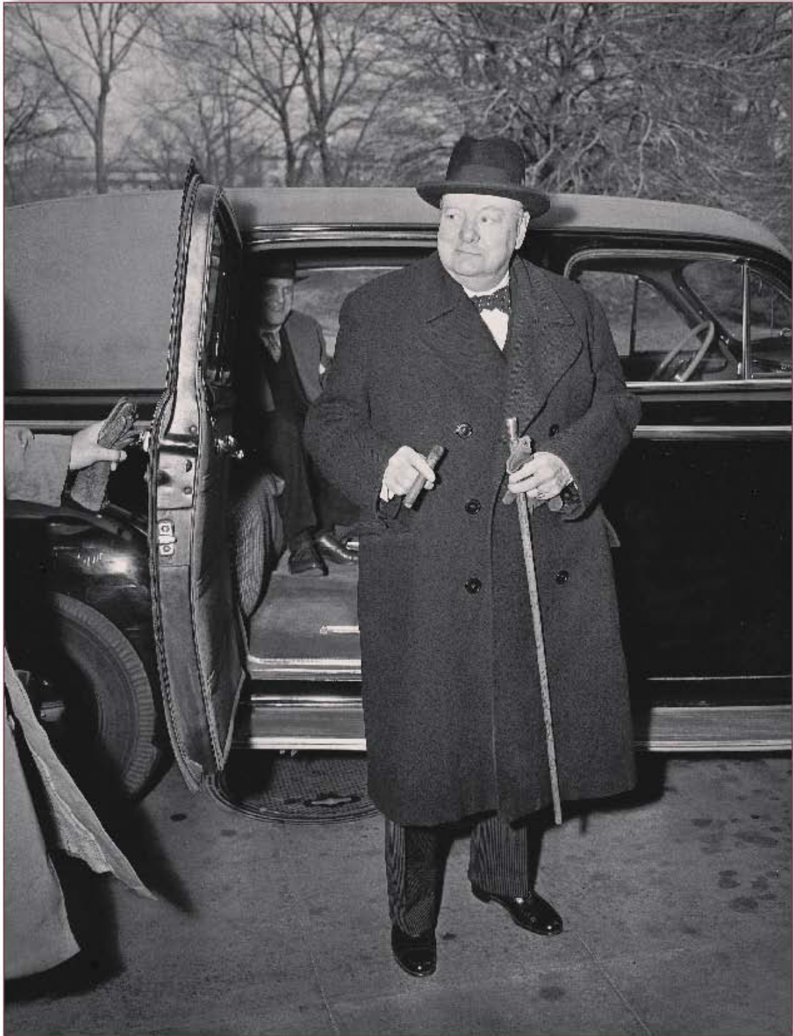
Winston Churchill, Britain's wartime prime minister, arrives at the White House in Washington on March 11, 1946.