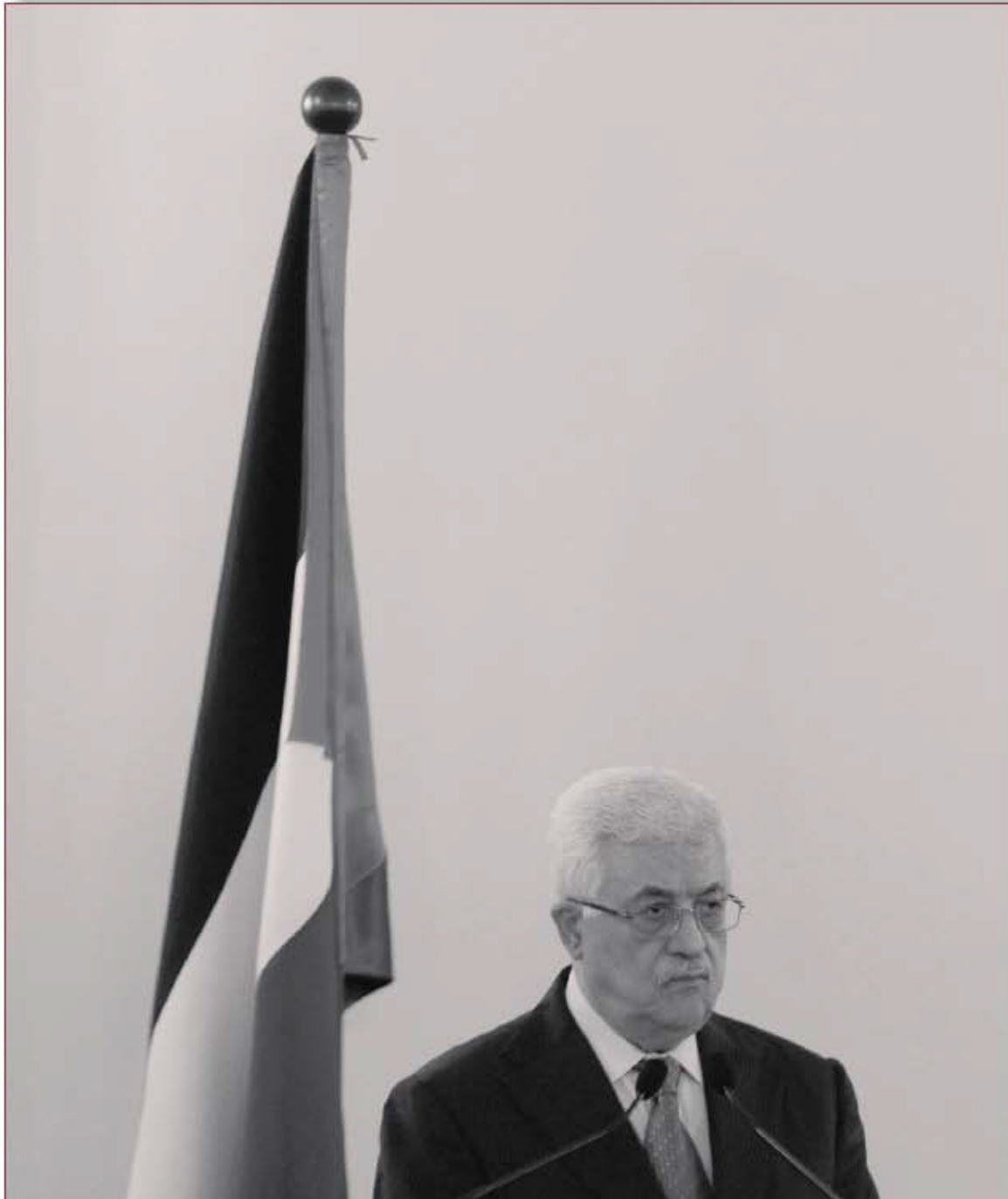
Palestinian President Mahmoud Abbas in Barcelona, Spain, July 20, 2011