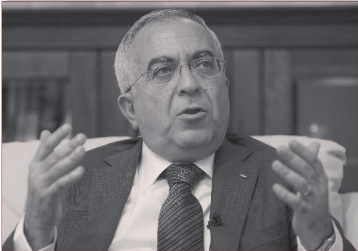
Palestinian Prime Minister Salam Fayyad, June 28, 2011

The Palestinian unilateral drive for statehood would pick up steam in the months ahead. Just ninety days after the inauguration of Israel's government in May 2009, when Benjamin Netanyahu, Israel's newly elected prime minister, announced a major shift in policy and accepted a Palestinian state with given security provisos, Fayyad announced a major two-year state-building project for the Palestinian-controlled areas of the West Bank, which he said would result in the creation of a "de facto" Palestinian state by September 2011. The Fayyad plan, as it came to be known, elicited great enthusiasm and gained broad financial and political backing from the United Nations, the Quartet, as well as European leaders and the Obama administration. 17