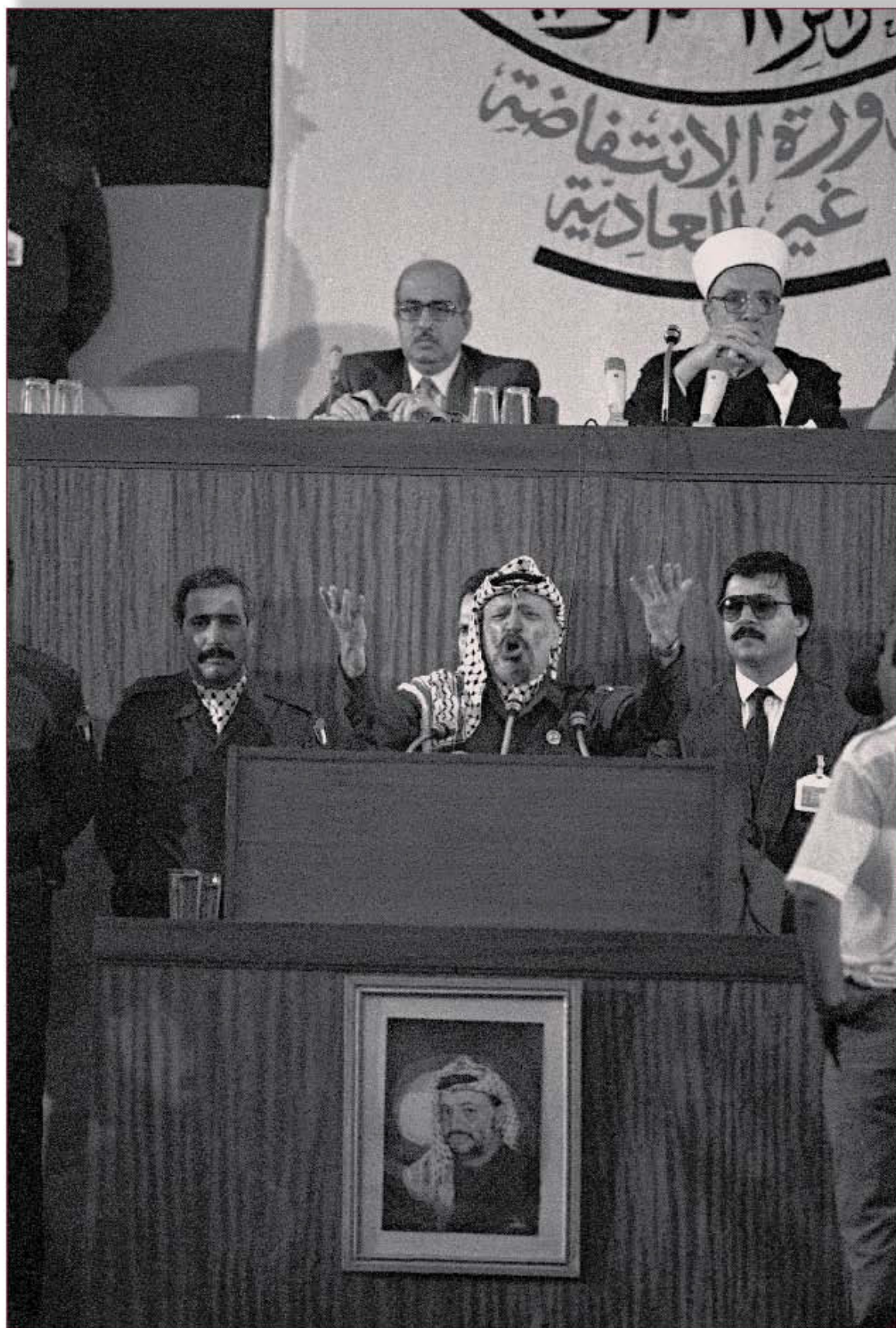
PLO Chairman Yasser Arafat addresses the Palestine National Council in Algiers, November 12, 1988.